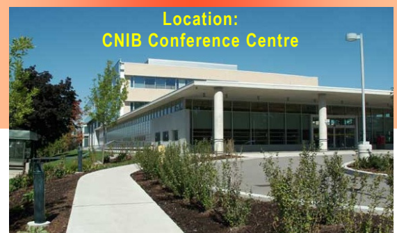
Location: CNIB Conference Centre

6:00pm - Wrap-up Cocktail Reception (cash bar)